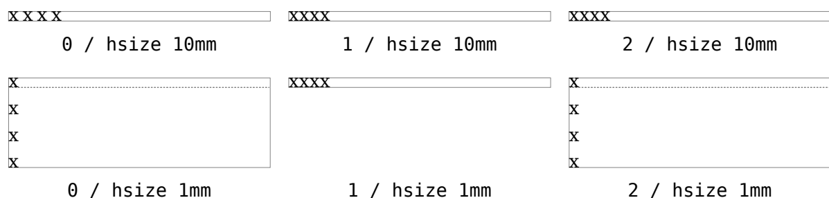
Figure 2.1 The \nospaces options.

This new primitive can be used to overrule the usual \spaceskip related heuristics when a space character is seen in a text flow. The value 1 triggers no injection while 2 results in injection of a zero skip. In figure 2.1 we see the results for four characters separated by a space.